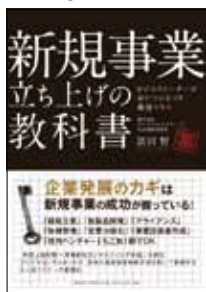
Instructional text of new business development -The most effective skill for business leaders- (2014) popular book at third impression