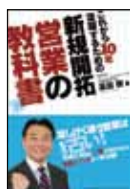
Instructional text of sales development for achieving good performance for 10 years from now (2012)