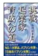
The challenging road to cultivate entrepreneurs (2004) Joint authorship